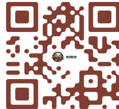
Join as a family