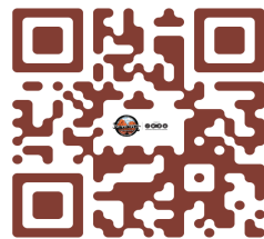
Join as a Individual

First join your local Chapter, The Sedona Mountain Bike Club